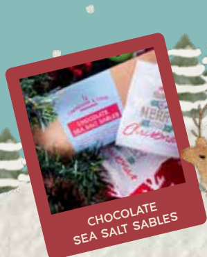
CHOCOLATE SEA SALT SABLES

Blackcurrants slow-simmered in Pinot noir - fruity and a bit boozy. Perfect on toast!